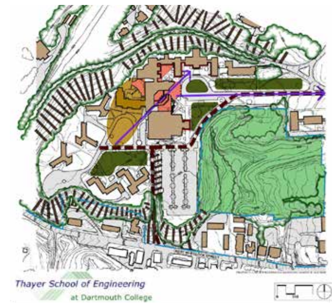
DESIGN FEATURES ANALYSIS DRAWING